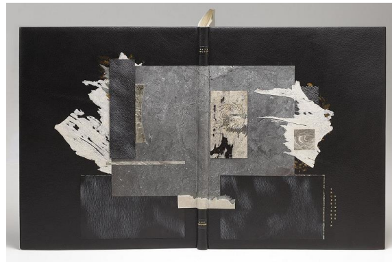
'Encheiresin Naturae' bound by Coleen Curry